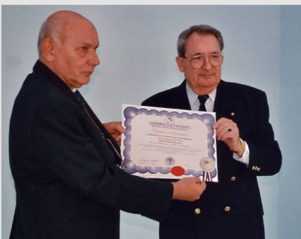
Ceremony in Germany, Sept. 2nd, 2004

A commencement ceremony took place in India in January 2004 at which honorary doctor diplomas from CU were conferred. See pictures here .